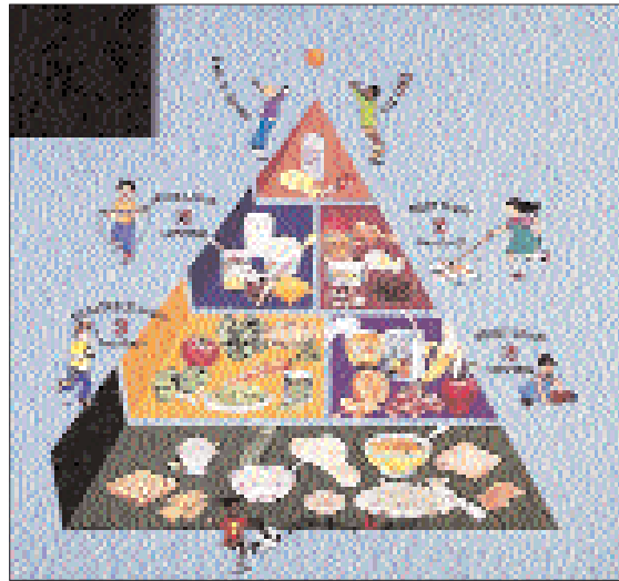
Figure 4. Food Guide Pyramid for young children two to six years old.

Physically, as the child progresses through the school years, fine motor development becomes quite good. In